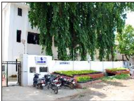
A view of Surgimedik unit

The Company is currently exporting its products to more than 25 countries, such as Saudi Arabia, Malaysia, Turkey, Singapore, Dubai, Egypt, Kuwait, Italy, Germany, Switzerland, Yemen, Sweden, Columbia, France & Argentina . The bulk of the sales currently are to the USA.