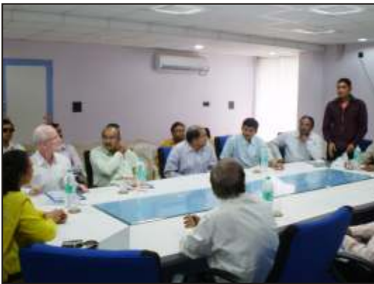
The DC in discussions with the unit holders and Developer

DGDC and the unit holders of SURSEZ are indeed thankful to the DC for taking time to visit SURSEZ. We shall look forward to regular visits by her.