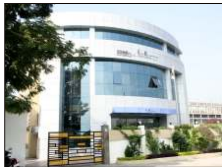
A view of the Invent Bio-Med Unit

In order to achieve total customer satisfaction, the company has successfully entered into strategic alliance with various manufacturers and distributors in India as well as overseas.